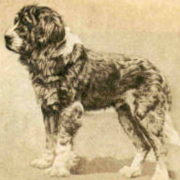
CHAMPION KING CARMEN