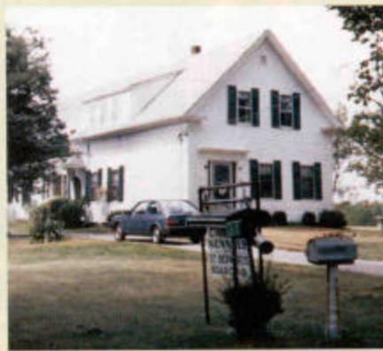
434 Elm Street, Bridgewater, for 60 years the home of Carmen Kennels.